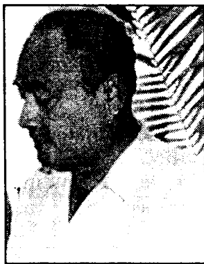
Sugar industry minister Valdemar Castillo delivered opening remarks.

sugar factory's mills will be used to produce high pressure steam, which will turn turbo-generators to produce 60 cycle electricity to be com-